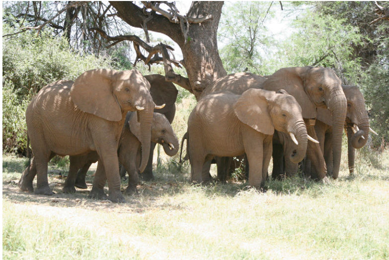
Figure 2. The Spice Girls family's reaction at the onset of playing bee buzz.

On hearing bee sounds, elephants demonstrated a variety of alarm behaviours [8] that appeared to ripple through the family. This included ceasing of any activity — feeding, sleeping, playing — raising of the head, ears out, slow turning of the head from side to side, headshaking and smelling with trunks both up and down towards the direction of the sound. Bunched retreat behaviour was usually led by one adult with tails in the air and backward glances towards the sound. In a typical flight run young calves were seen running directly next to their mothers with tails up, ears out and flicking their trunk from side to side. In this trial, the family took 18 seconds between onset of the sound and the start of a group retreat lead by the matriarch, Rosemary (collared individual to right of photo).